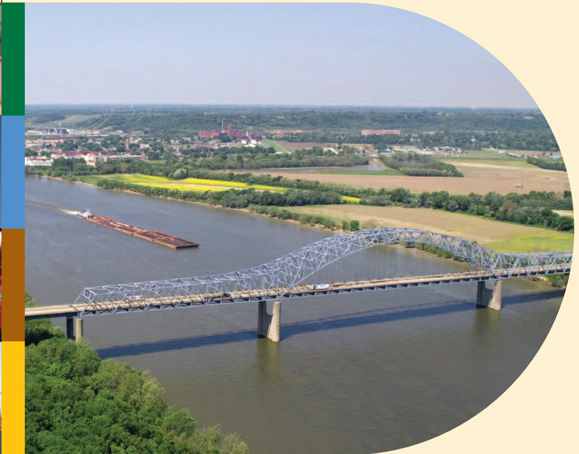
Aurora Greendale Lawrenceburg